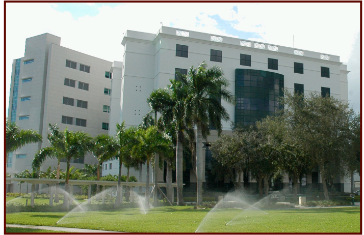
Above: Collier County Courthouse Campus. Original Courthouse is in the foreground. Annex is in the background to the left.