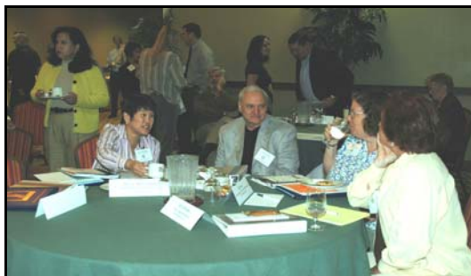
Working on a group assignment during break.

and through interactive group work, understand the importance of good