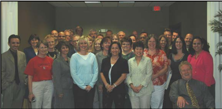
Participants in the ICM Criminal Case Flow Management held October 18—20 at the Holiday Inn Bell Tower.

This weeklong course combines elements of leadership, management techniques, and specific court issues in a program that provides participants with the necessary knowledge, skills and abilities to achieve their professional goals as court managers. Incorporating nationally recognized articles and books on leadership, management and court issues, this course will expand upon and integrate court management competencies identified in the NACM Core Competencies. Participants will build upon the Phase 1 foundational courses and explore the roles and purposes of courts; deal with the concepts of judicial independence and