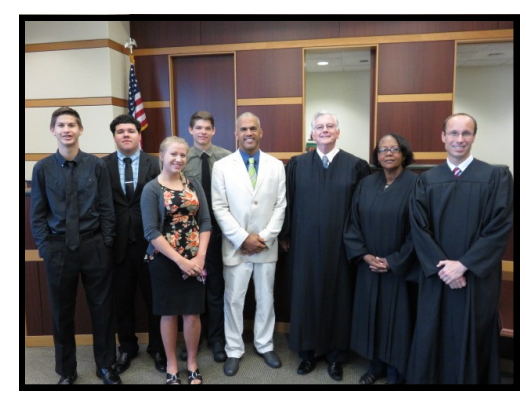
Second DCA Judges and a group of students

Three Judges from the Second District Court of Appeals visited Lee County for their annual visit during Law Week 2015.