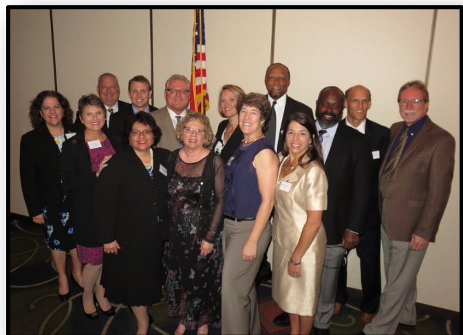
Judges who attended dinner from Lee, Collier, and Charlotte counties.